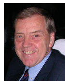
Tony Parker International Council of Sport Science and Physical Education, Australia